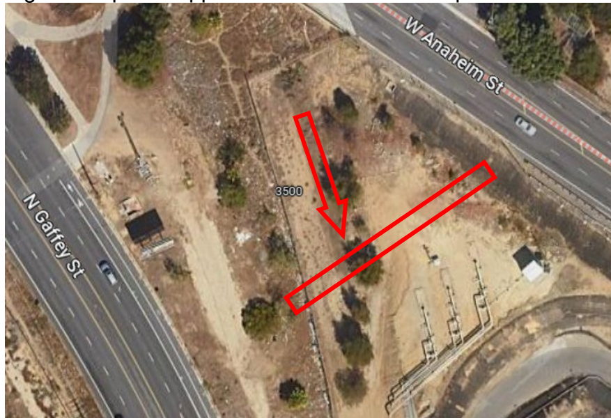
Figure: Map and Approximate Location of Proposed Easement

Location – A segment of this Project is on a portion of P66's property near North Gaffey Street and West Anaheim Street in San Pedro. Approval of the Agreement will allow LADWP to use approximately 937 square feet along an embankment in P66's property for a segment of the recycled water pipeline. Figure 1 below is an approximate depiction of the location of the proposed easement.